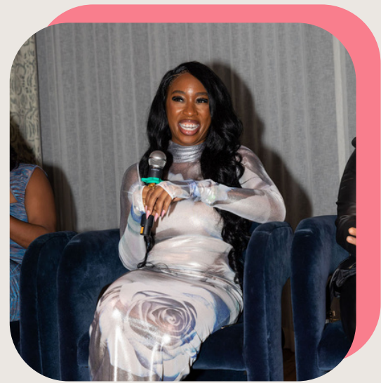
MELANIN MOI X AFROTECH Panelist | 2023