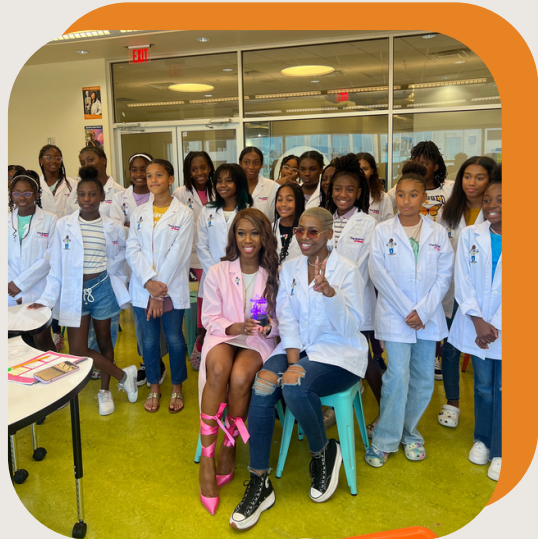
SCIENCE OF BEAUTY STEM CAMP Keynote Speaker | 2023