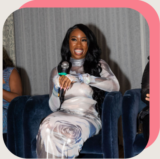
MELANIN MOI X AFROTECH Panelist | 2023