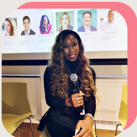
LINKEDIN CREATOR Panelist | 2022