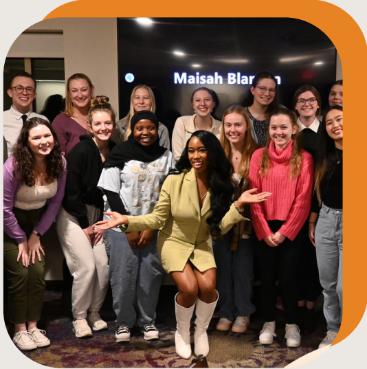
ST CATHERINE UNIVERSITY Keynote Speaker | 2023